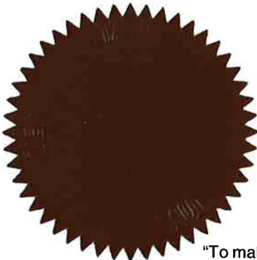
Chief Inspector Boilers and Pressure Vessels Safety

"To make people's lives better by enhancing public safety" Visit our Web site: www.tssa.org